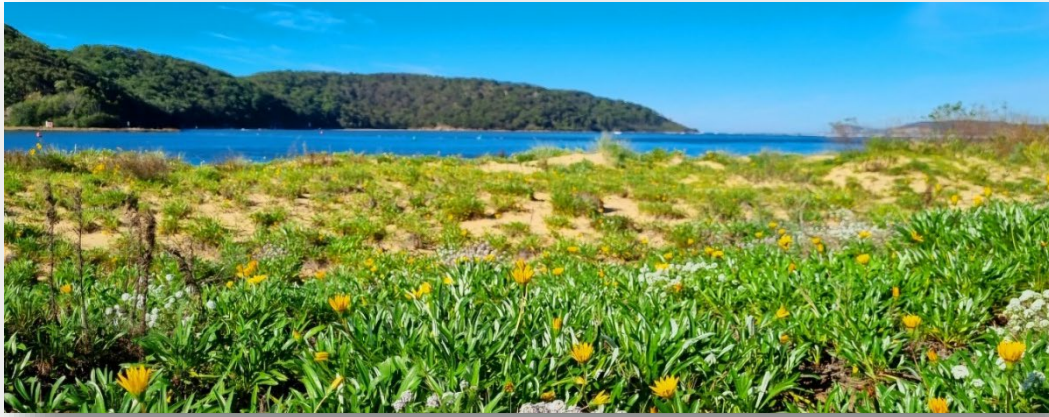
Looking across the bay from the point at Ettalong Beach.