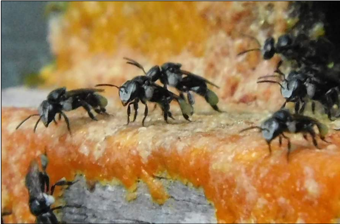
Native Bees @ Pearl Beach Arboretum. Thanks, Janine, for this amazing photo.